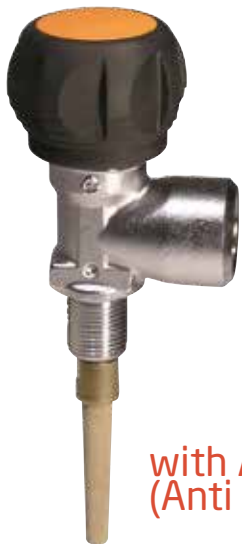
with ACS handwheel (Anti Closing System)