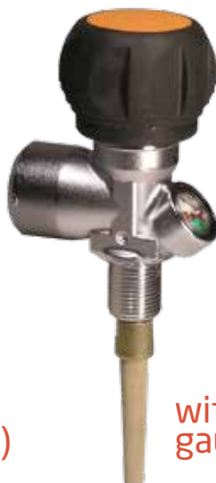
with pressure gauge